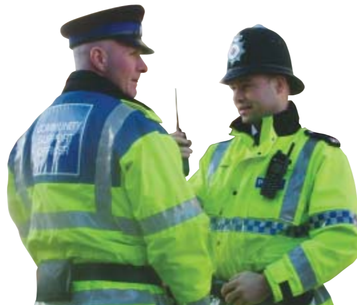
Police, Fire and Rescue, County Council and other organisations. The MAPS Team can deal with issues of ASB practically and at a local level.